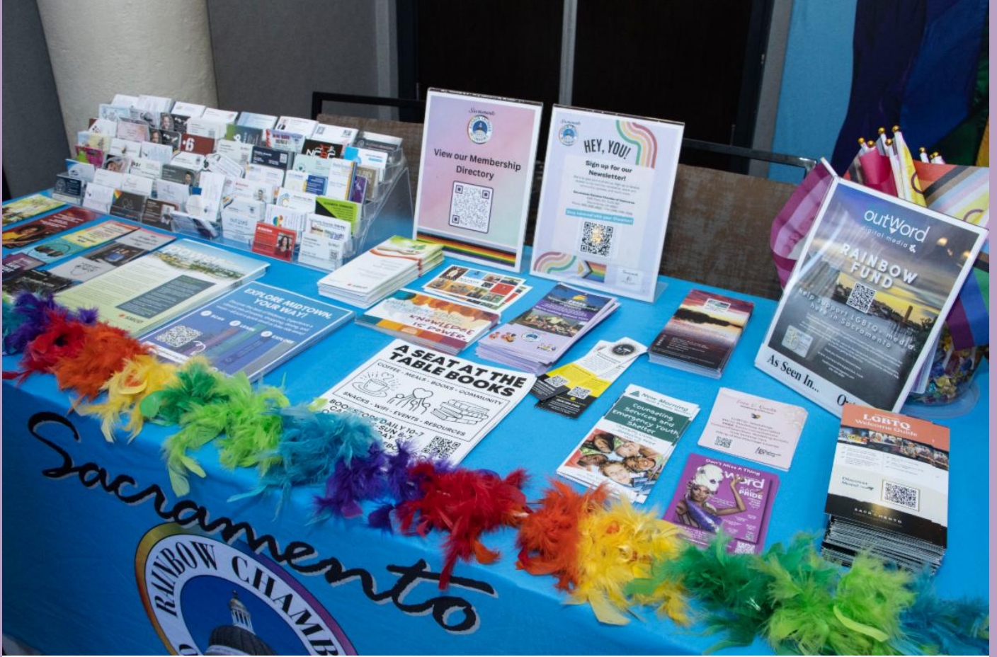
Business and Community Excellence Awards Expo