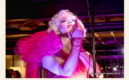
Cancer is A Drag! April 13, 2023

2023 Business and Community Excellence Awards March 23, 2023